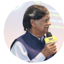
SHRI ANIL SHASTRI JI Former central Minister and son of former Prime Minister Shri Lal Bahadur Shastri March 2024