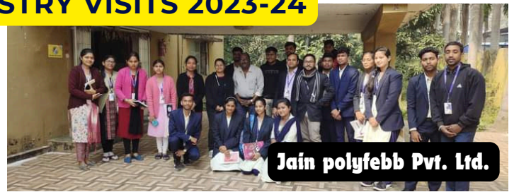
Jain polyfebb Pvt. Ltd.