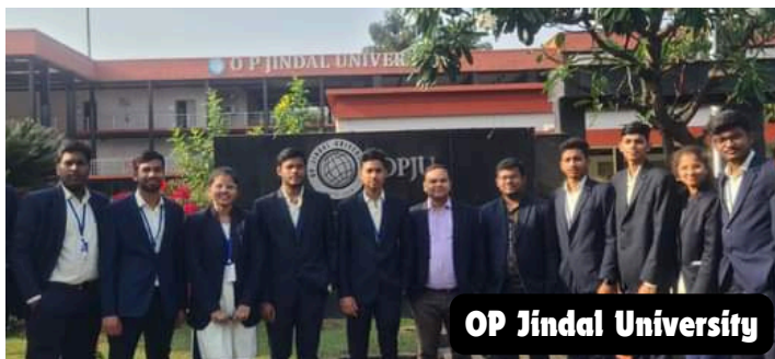
OP Jindal University