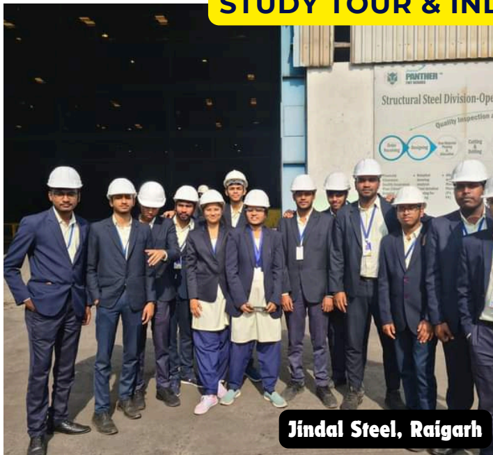
Jindal Steel, Raigarh