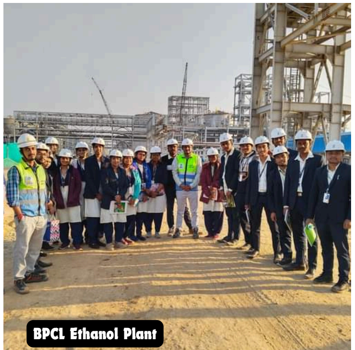
BPCL Ethanol Plant